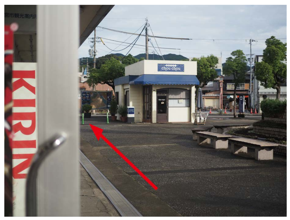
Proceed to the left from out of the Shingu Station Exit